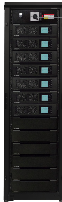
M90S-42k 42kVA/42kW with 8 minute battery in 42U rack

Battery Module includes 16 pieces of 12V 580W batteries